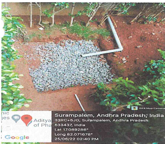
Rainwater harvesting through recharge pit

A recharge pit with dimensions of 10x10 feet was constructed where a pipe attached to it drains off the rainwater. Thus harvesting the rainwater.